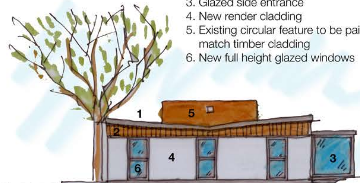
Proposed West Elevation 1:100