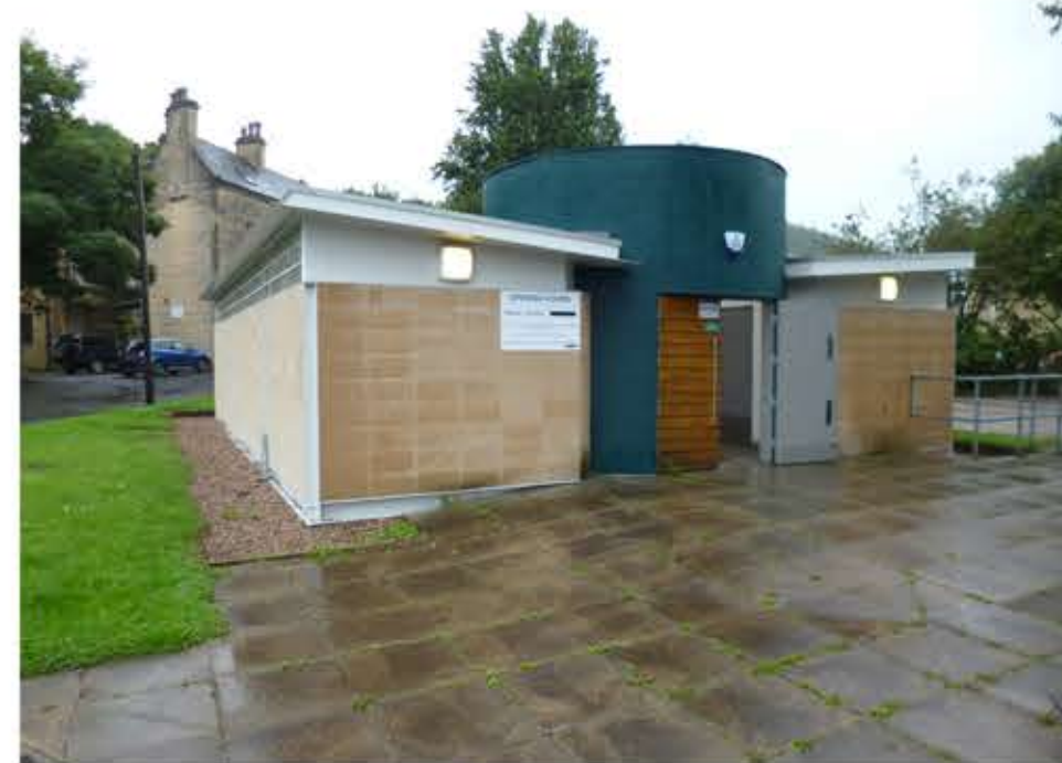
View showing front entrance to the building.