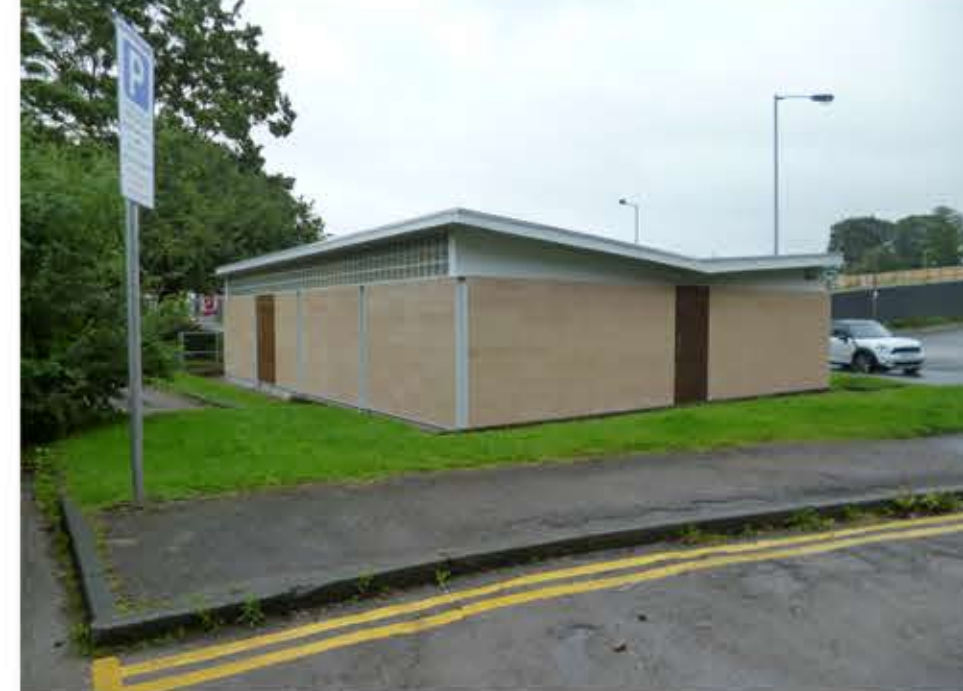
View showing side and rear of the building.