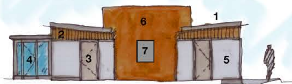
Proposed East Elevation 1:100