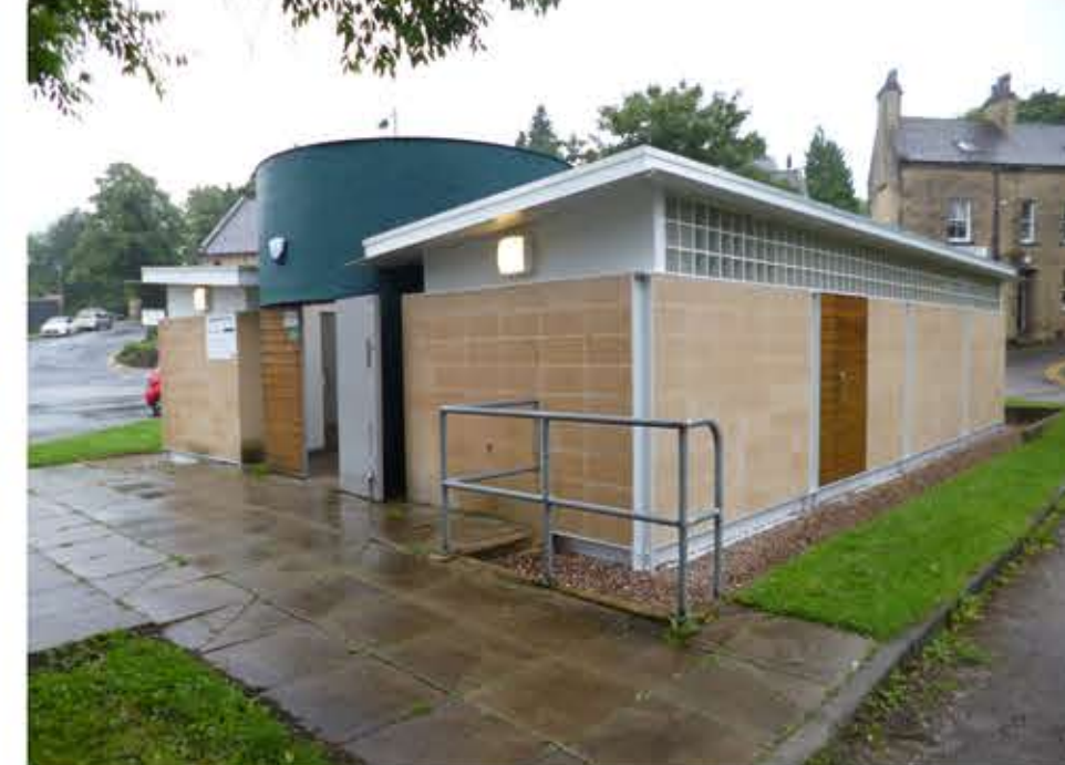
View showing front and side of building.