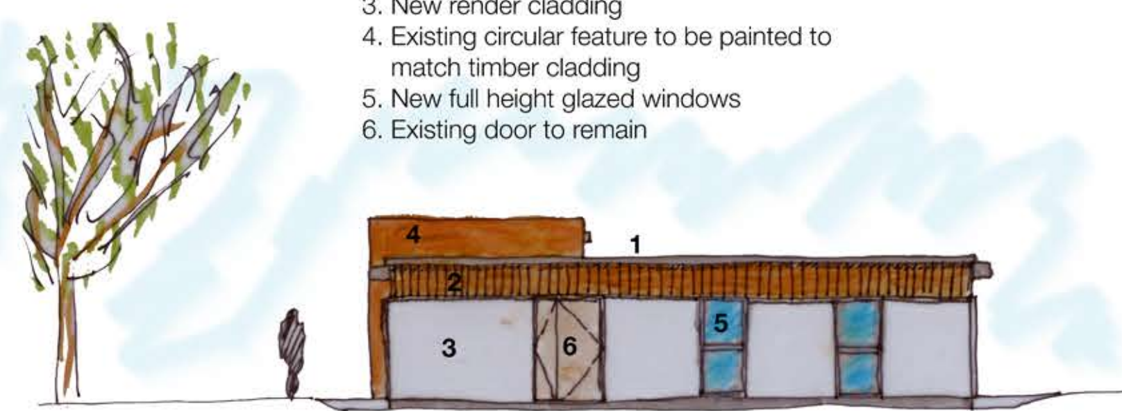
Proposed North Elevation 1:100