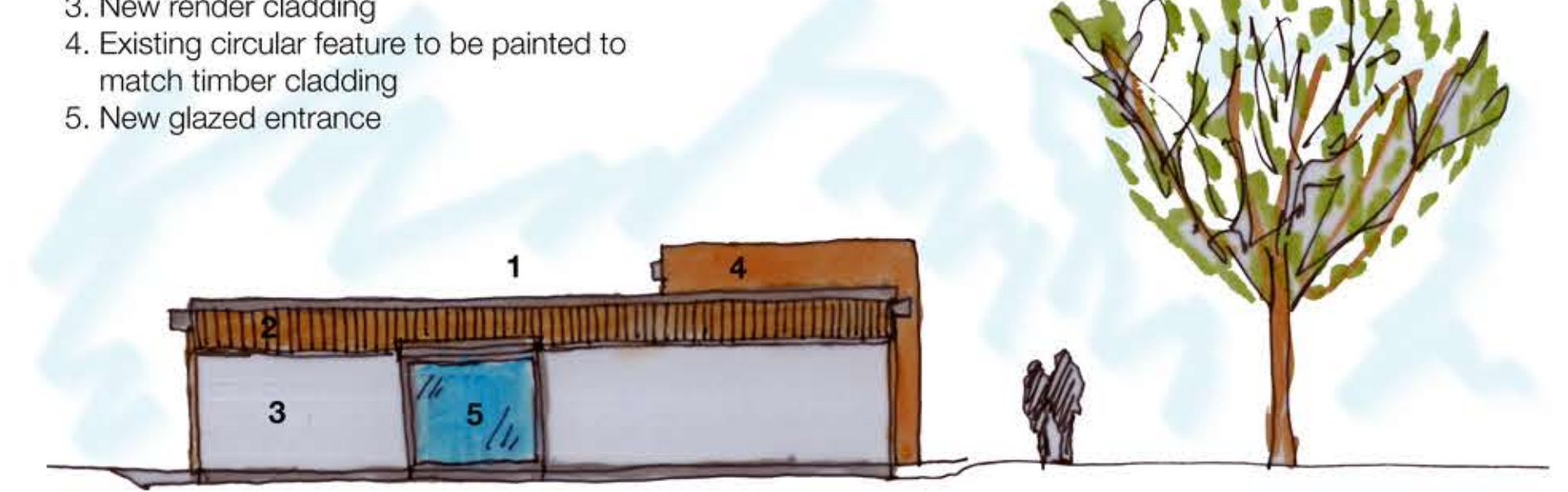
Proposed South Elevation 1:100